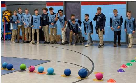
7th grade boys