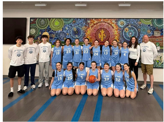
8th grade girls