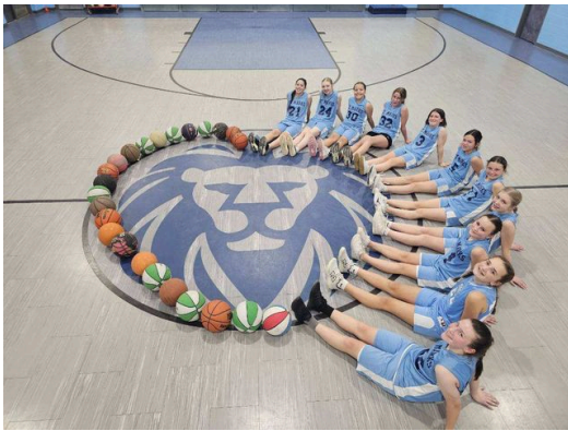
7th grade girls