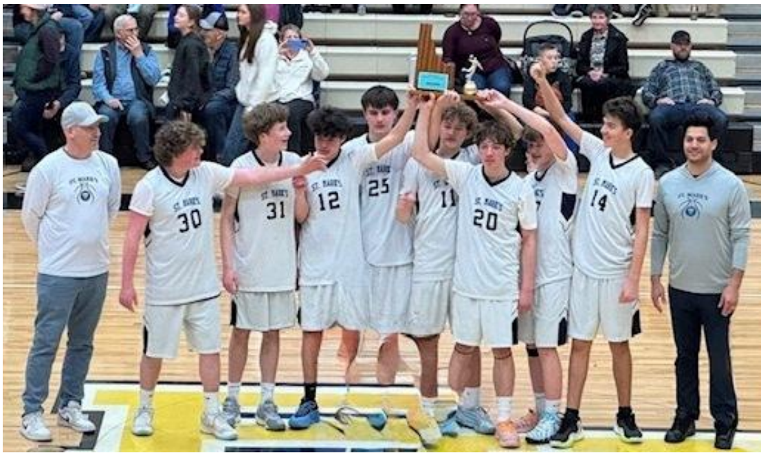
Our 8th grade boys are Hallissey Champions